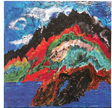
Look and See