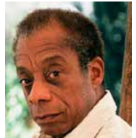
James Baldwin was an American novelist, playwright, essayist, poet, and activist. His essays, as collected in Notes of a Native Son, explore intricacies of racial, sexual, and class distinctions in mid-20th-century USA.

“In order for this to happen, your entire frame of reference will have to change, and you will be forced to surrender many things that you now scarcely know you have.”