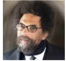
Cornel West is an American philosopher, political activist, social critic, author, and public intellectual.

“Last, but not least, there is a need for audacious hope. And it’s not optimism. I’m in no way an optimist. I’ve been black in America too long. No ground for optimism here, given the progress and regress and three steps forward and four steps backward. Optimism is a notion that there’s sufficient evidence that would allow us to infer that if we keep doing what we’re doing, things will get better. I don’t believe that. I’m a prisoner of hope, that’s something else. Cutting against the grain, against the evidence. William James said it so well in that grand and masterful essay of his of 1879 called “The Sentiment of Rationality,” where he talked about faith being the courage to act when doubt is warranted. And that’s what I’m talking about.” — Cornel West