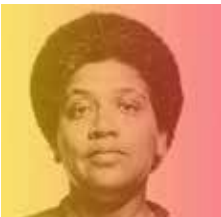
Audre Lorde was an American writer, feminist and civil rights activist known for confronting injustices.

I have come to believe over and over again that what is most important to me must be spoken, made verbal and shared, even at the risk of having it bruised or misunderstood... In becoming forcibly and essentially aware of my mortality... what I most regretted were my silences. Of what had I ever been afraid? ...My silences had not protected me. Your silence will not protect you.