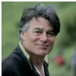
David Whyte is a poet, author, speaker and organizational thinker. He lectures to large audiences throughout the world. He has said that all of his poetry and philosophy are based on “the conversational nature of reality.”

Sometimes if you move carefully through the forest, breathing like the ones in the old stories, who could cross a shimmering bed of leaves without a sound, you come to a place whose only task is to trouble you with tiny but frightening requests, conceived out of nowhere but in this place beginning to lead everywhere. Requests to stop what you are doing right now, and to stop what you are becoming while you do it, questions that can make or unmake a life, questions that have patiently waited for you, questions that have no right to go away.