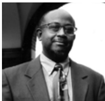
Michel-Rolph Trouillot was a Haitian academic and anthropologist. He was Professor of Anthropology and of Social Sciences at the University of Chicago.

“. . . But the past does not exist independently from the present. Indeed, the past is only past because there is a present, just as I can point to something over there only because I am here. But nothing is inherently over there or here. In that sense, the past has no content. The past — or more accurately, pastness — is a position. Thus, in no way can we identify the past as past.”