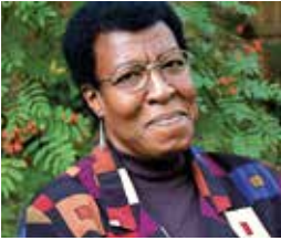
Octavia Butler was an American science fiction author. In 1995 she became the first science-fiction writer to receive a MacArthur Fellowship.

“We keep falling into the same ditches, you know? I mean, we learn more and more about the physical universe, more about our own bodies, more technology, but somehow, down through history, we go on building empires of one kind or another, then destroying them in one way or another. We go on having stupid wars that we justify and get passionate about, but in the end, all they do is kill huge numbers of people, maim others, impoverish still more, spread disease and hunger, and set the stage for the next war. And when we look at all of that in history, we just shrug our shoulders and say, well, that's the way things are. That's the way things always have been.”